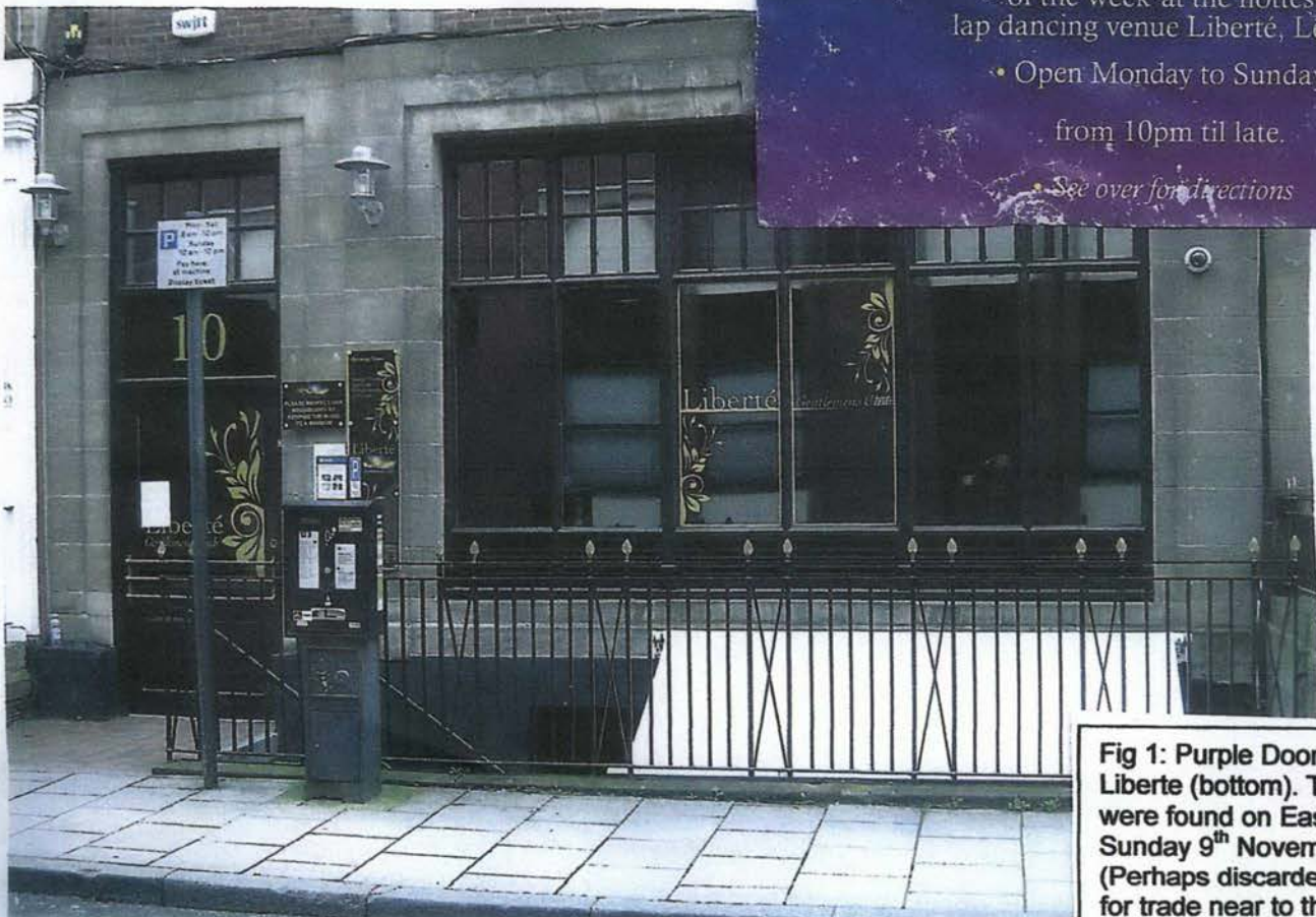
Fig 1: Purple Door (top) Liberté (bottom). The two tickets were found on East Parade early on Sunday 9 th November 2014. (Perhaps discarded by staff touting for trade near to the Town Hall).