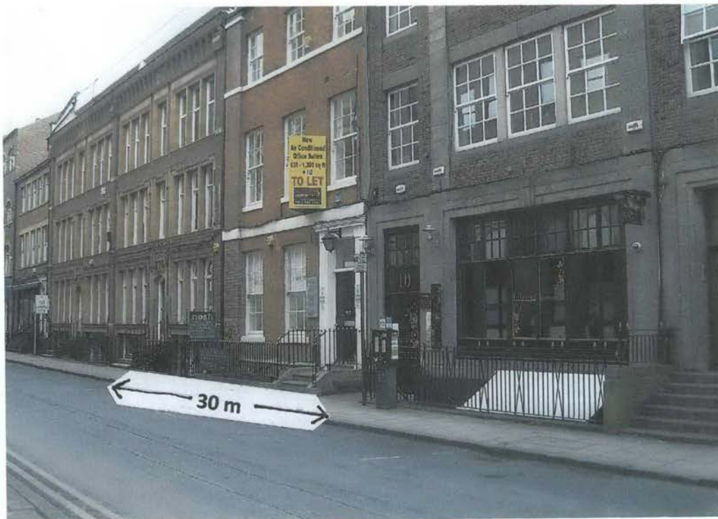
Fig 8: Liberte to Leeds Children's Charity (Representation)

The door of Liberte is 30 metres 19 from the office of Leeds Children's Charity. (Fig 8)