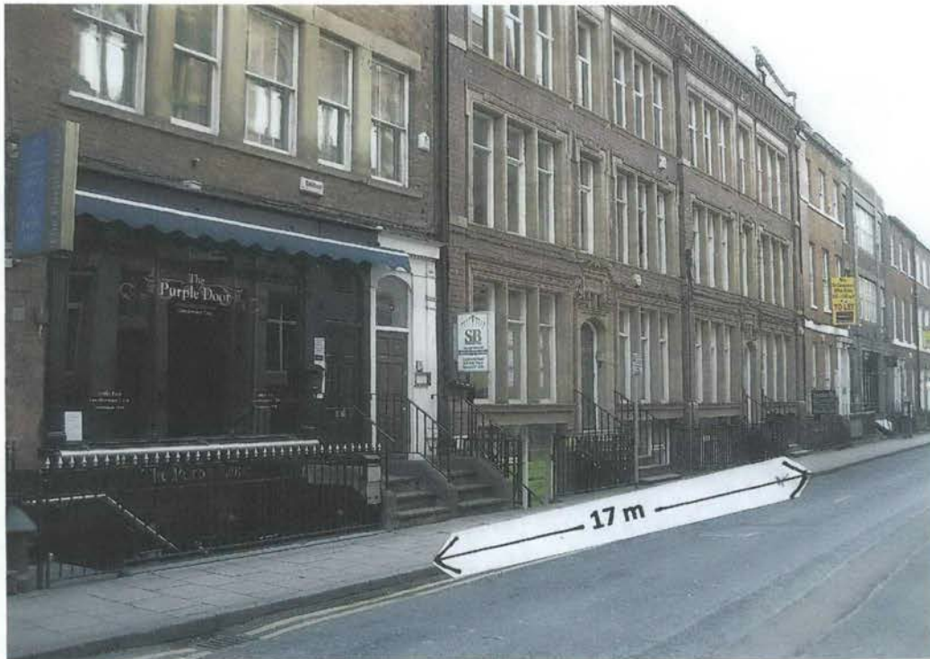
Fig 7: Purple Door to Leeds Childrens' Charity (Representation)

3.17 The door of Purple Door is 17 metres from the office of Leeds Children's Charity. (Fig 7)