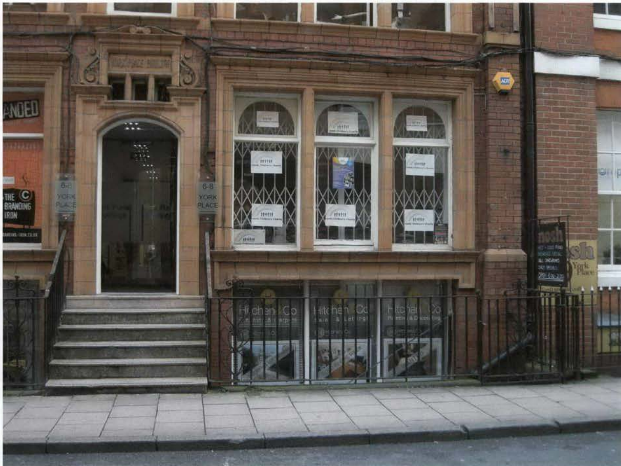
Fig 5: Leeds Children's Charity Offices , 6-8 York Place, Leeds

(Purple Door is at 5 York Place and Liberte is at number 10.)