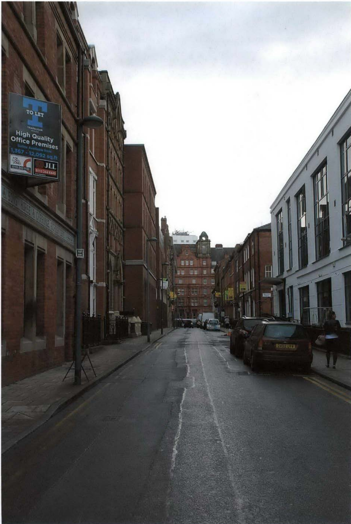
Fig 2: York Place from the west